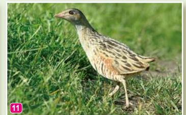
Corn crake Crex crex