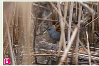
Little crane Porzana parva