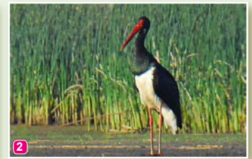
Black stork Ciconia nigra