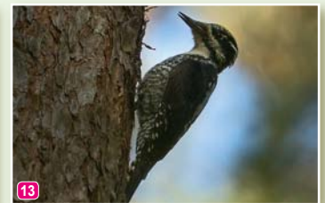
Three-toed woodpecker Picoides tridactylus