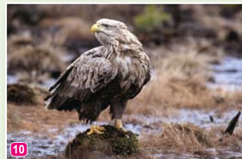
White-tailed eagle Haliaeetus albicilla