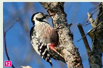
White-backed woodpecker Dendrocopos leucotos