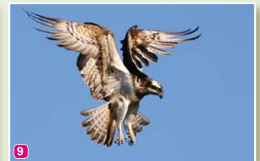
Osprey Pandion haliaeetus