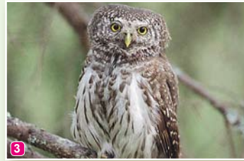
Eurasian pygmy owl Glaucidium passerinum