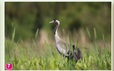
Crane Grus grus