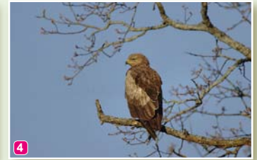
Lesser spotted eagle Aquila pomarina