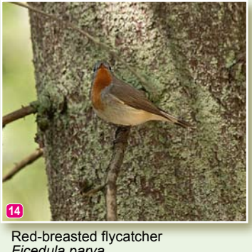
Red-breasted flycatcher Ficedula parva