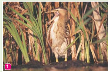
Great bittern Botaurus stellaris

— — — — — bird can be seen regularly; - - - - - bird can be seen occasionally, * – bird voices can be heard