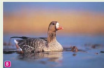
Goose Anser albifrons