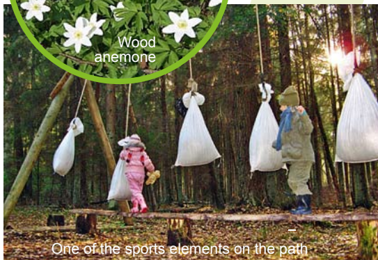
One of the sports elements on the path