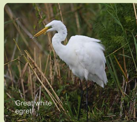
Great white egret